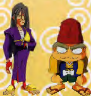
Grandma and Grandpa

They belong to the clan of the keeper who have been guarding the "Key of the Secret Treasure" since ancient times. Though they know their duty, they no longer remember the meaning of the Key.